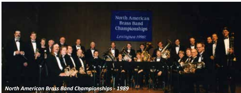
North American Brass Band Championships - 1989