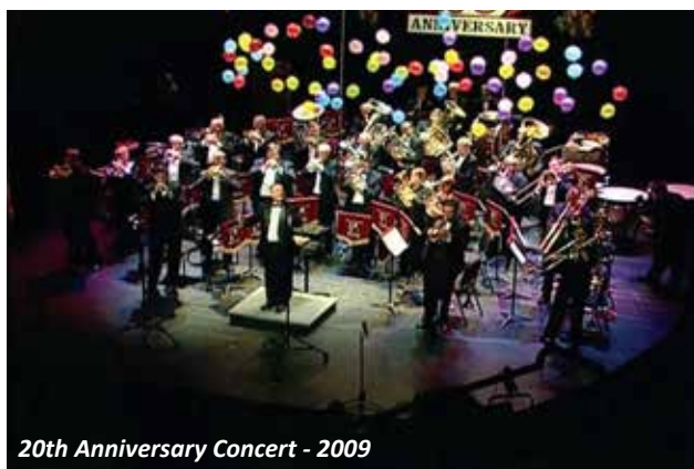
20th Anniversary Concert - 2009