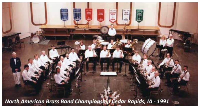
North American Brass Band Championship Cedar Rapids, IA - 1991