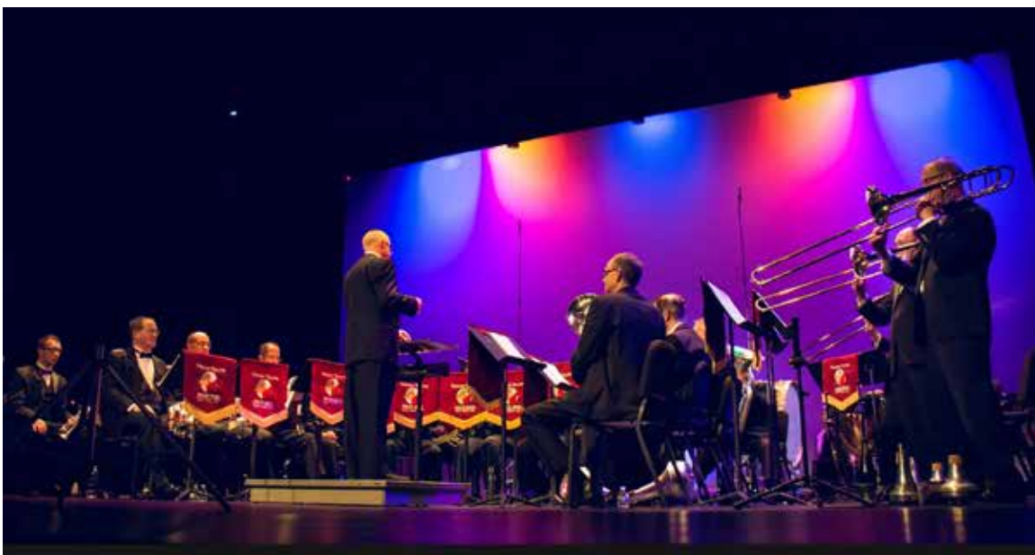
Spring Concert, 2017